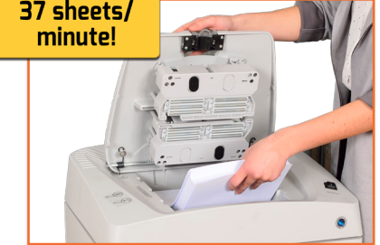
Up to 400 sheets paper tray for auto-feed system: 37 sheets per minute shredding speed