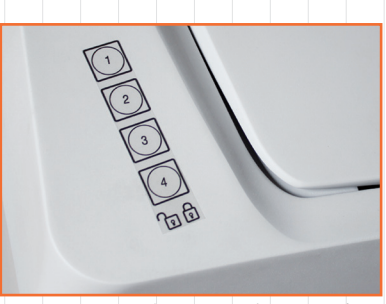
(Option) 4 Digit Electronic Combination Lock