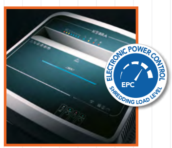
TOUCH SCREEN PANEL: just touch the controls to activate the machine functions

STURDY AND LARGE VOLUME 205 LITRE STEEL CABINET, mounted on casters