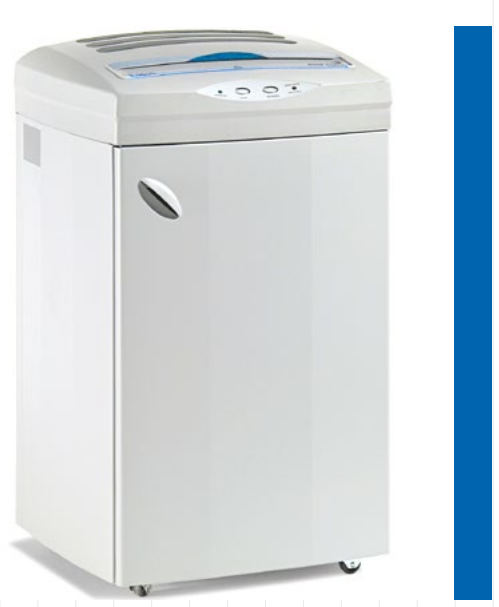
CERTIFICATION MARKS: CB - CSA - CE