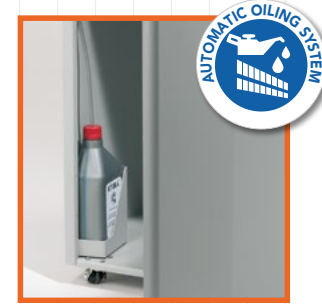
FRONT DOOR FOR EASY EMPTYING of collection bag