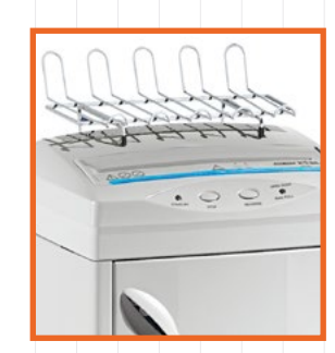
TOP SHELF (OPTION) Document top shelf to save office space (space saving design)