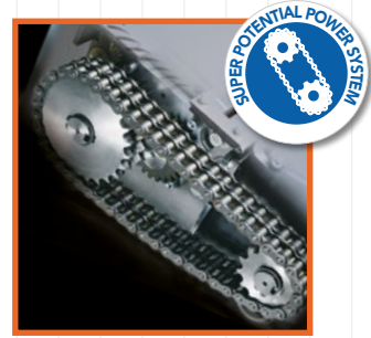
SUPER POTENTIAL POWER SYSTEM heavy duty chain drive system with