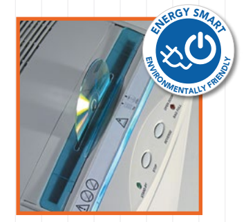
ENERGY SMART® Power management system with illuminated indicators for power saving in stand-by mode