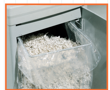
FRONT DOOR FOR EASY EMPTYING of collection bag holding high volume of shredded materials.

Power management system with optical indicators for power saving stand-by mode