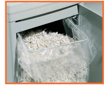
FRONT DOOR FOR EASY EMPTYING of collection bag holding high volume of shredded materials.

Power management system with optical indicators for power saving stand-by mode