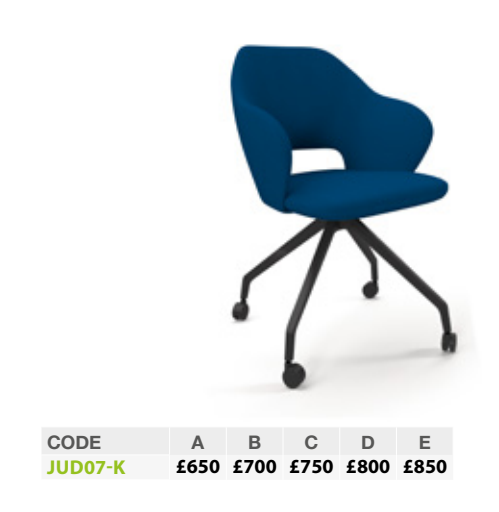
Cube Upholstered Stool to fit in A-Frame