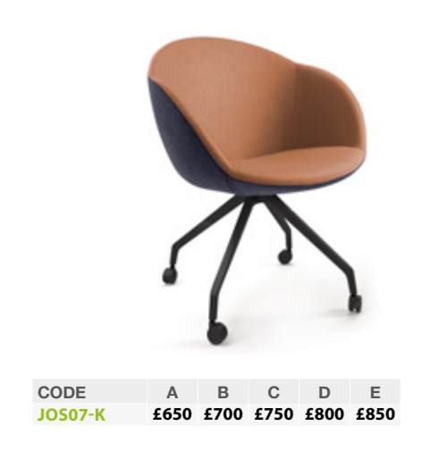
Upholstered Seat with Pyramid Base & Castors