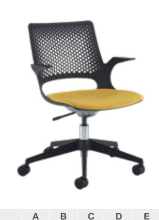
CODE A B C D E SLS305-K £411 £422 £438 £465 £480