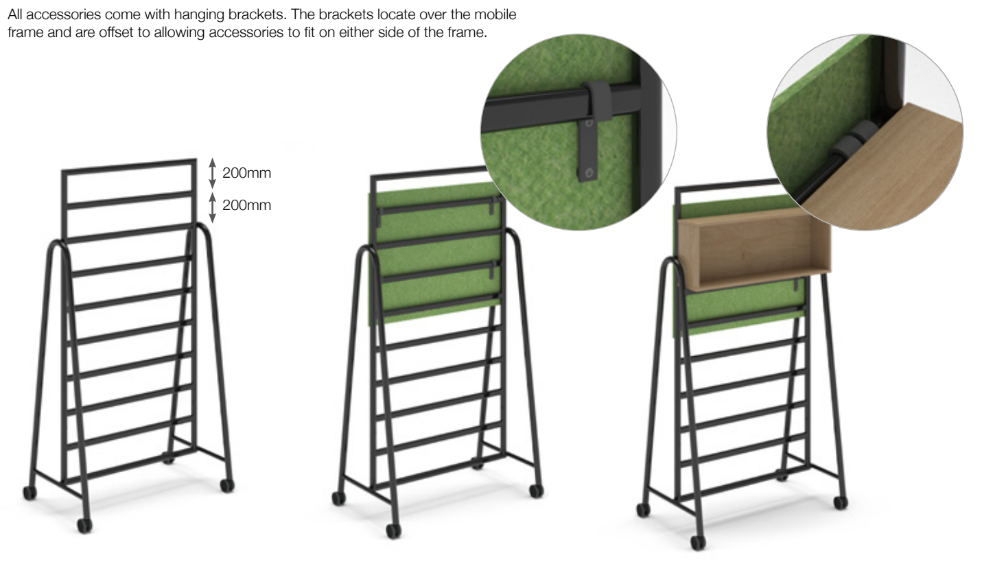
Mobile frame, rails are 200mm apart